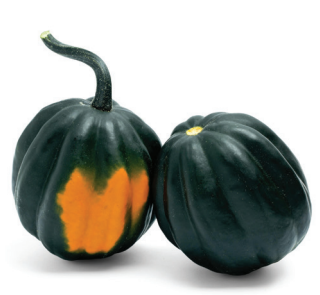
Table Confection Cucurbita pepo, Acorn Group

The exterior is an attractive glossy black green, thus retaining the green color longer than the regular dark green acorn squash. The fruit flesh is orange-yellow, smooth and melting, with a roasted-chestnut flavor, averaging 13–14% soluble solids (compared to 7-8% in classical varieties). For utmost quality, the fruits should be picked when completely ripe, 50 days after anthesis when the ground spot is intense orange, approximately 110 days after sowing.